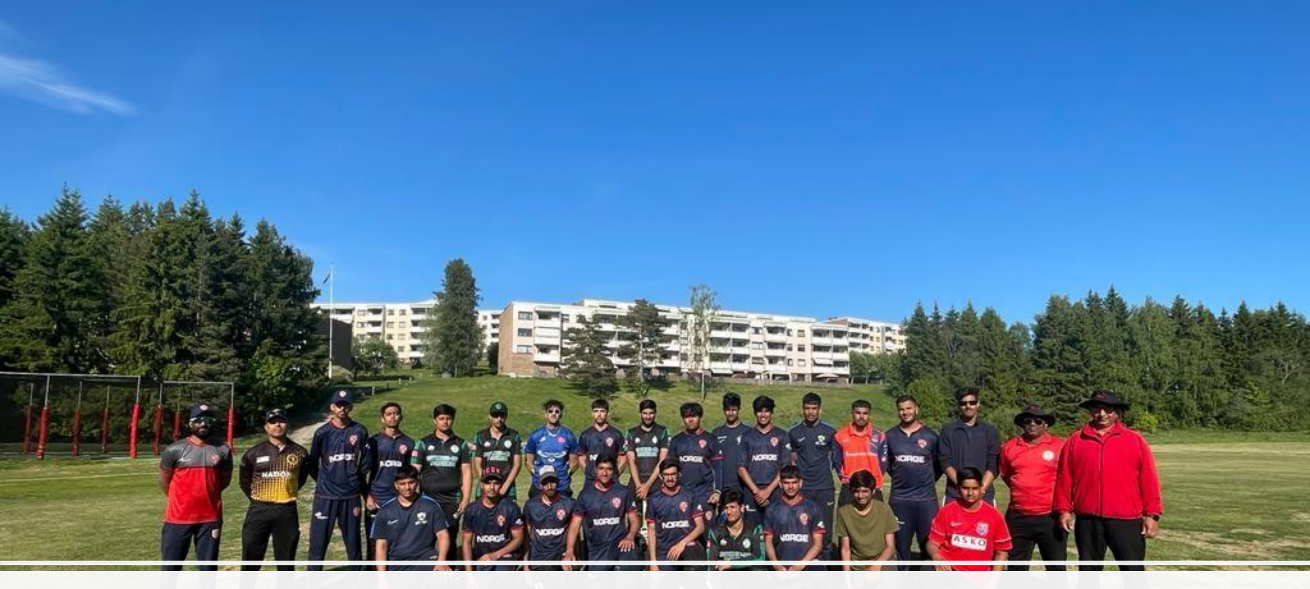
ICC U19 Men's Cricket World Cup Europe Qualifier