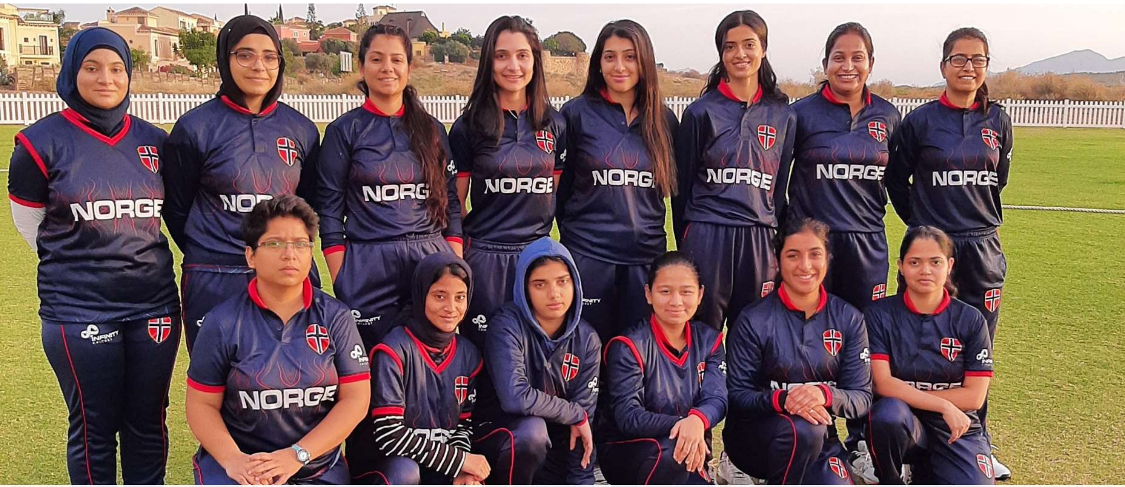
National team pool women's